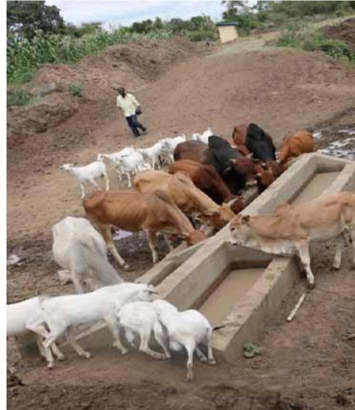
Mikuyuni earth dam