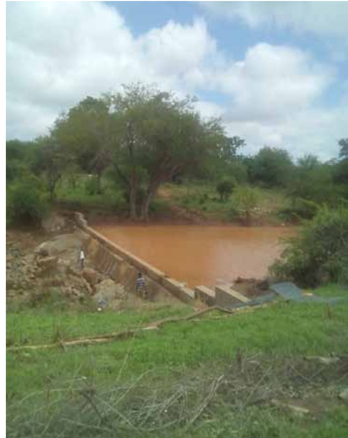
Ngomano Sand dam