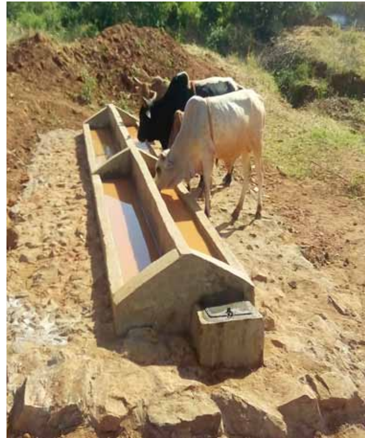
Kaumbu Earth dam