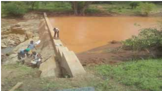
Ngomano Sand dam before (above) and (below) after