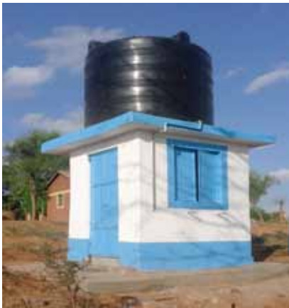
Pipeline distribution during (above) and (below) after construction