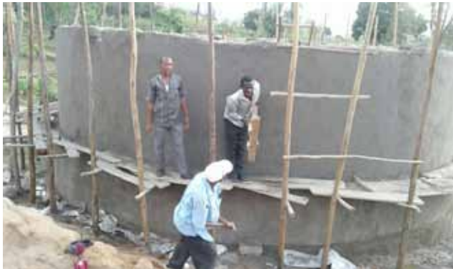
Kamuyuni rock catchment (before) and (below) after construction