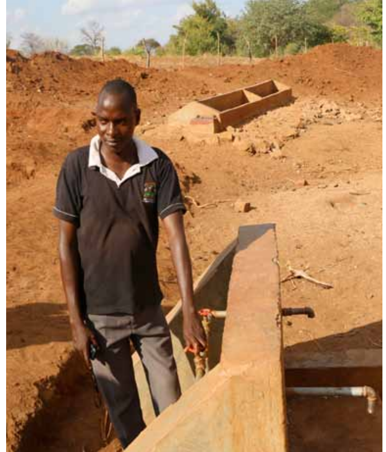
Kalikuvu Earth dam