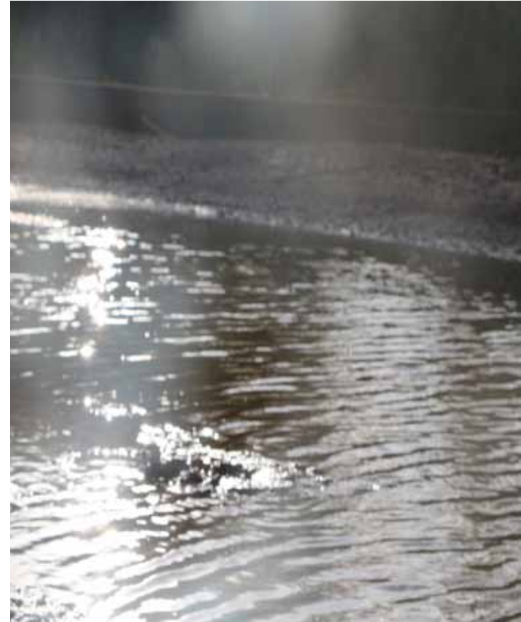
Kaayo earth dam