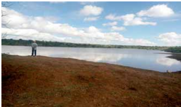
Mikuyuni earth dam (during) and (below) after construction