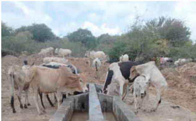
Kaayo earth dam before (above) and (below) after