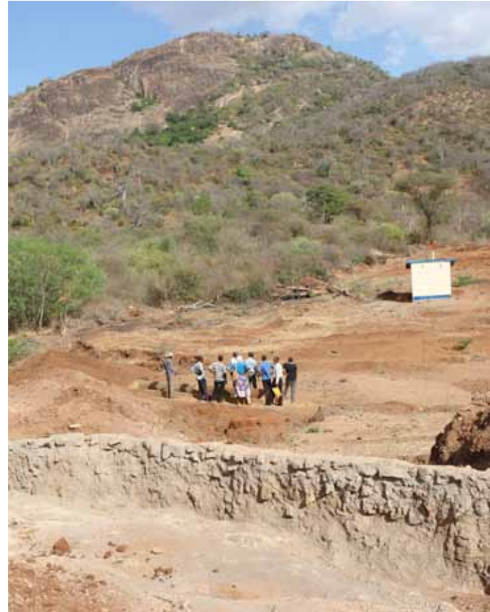
Kwa Mboo Earth dam