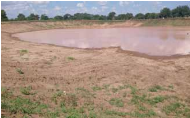
Makithuri earth dam before (above) and (below) after