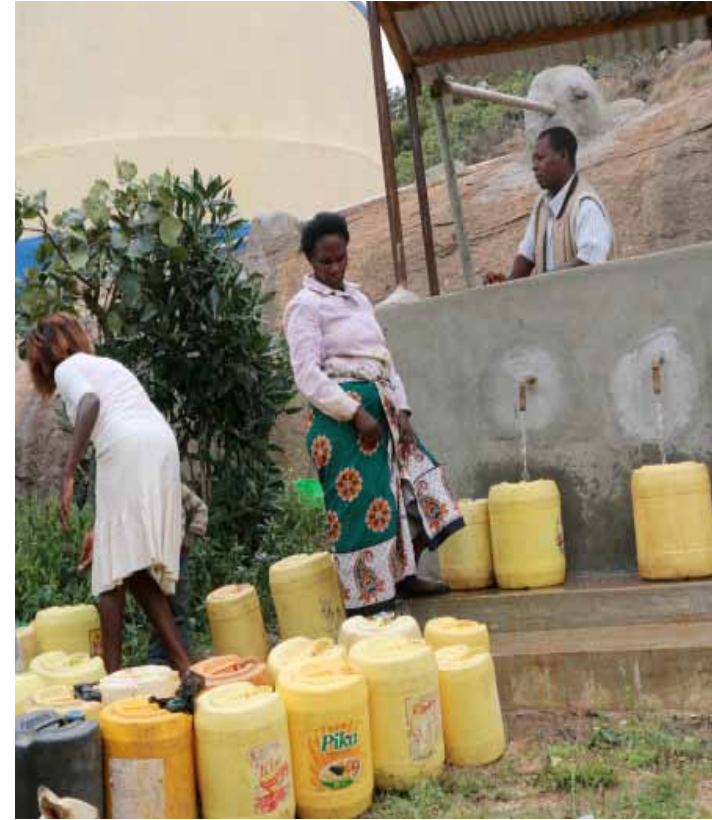
Kamuyuni rock catchment