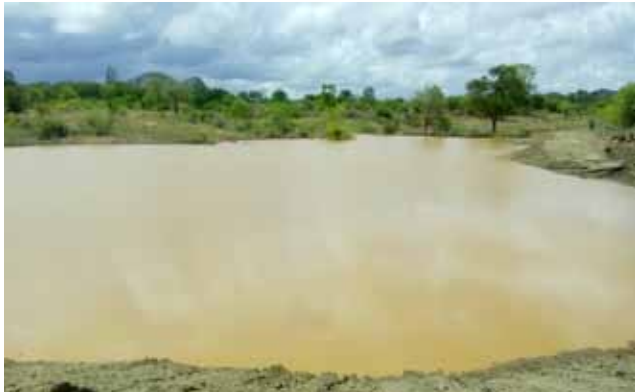
Kaumbu Sand dam before (above) and (below) after