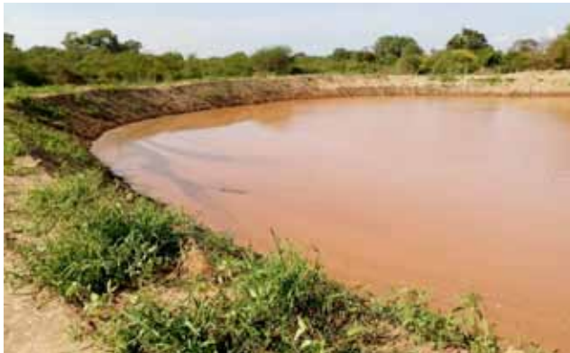
Kalikuvu Earth dam before (above) and (below) after