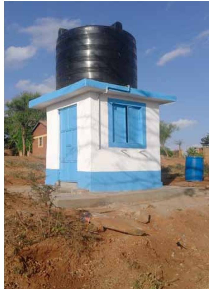
Iiani kwa Ndungu pipeline distribution