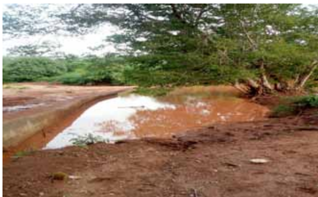
Kyandev Sand dam before (above) and (below) after