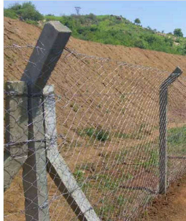
Makithuri earth dam after construction