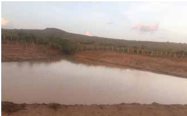
Kwa Mboo earth dam