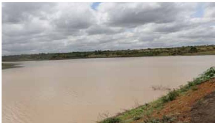
Mutethya Nzaini before (above) and (below) after construction