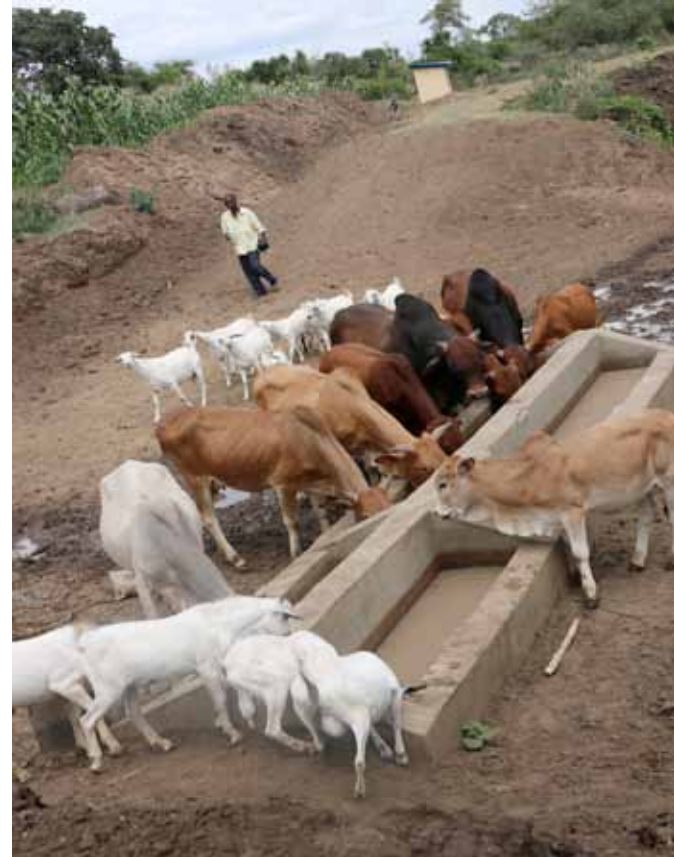
Mutethya Nzaini investments after construction