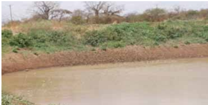
Itukisya Earth dam (during) construction and (below) after