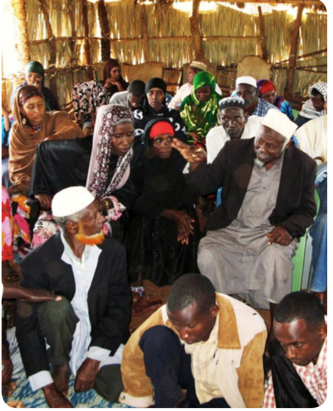
Community consultation in Isiolo to identify priorities.