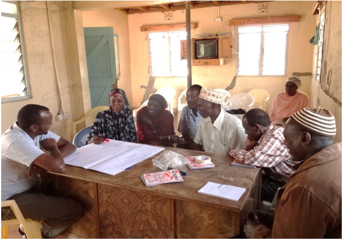
Sericho Ward Adaptation Planning Committee discussing Monitoring and Evaluation of Adaptation