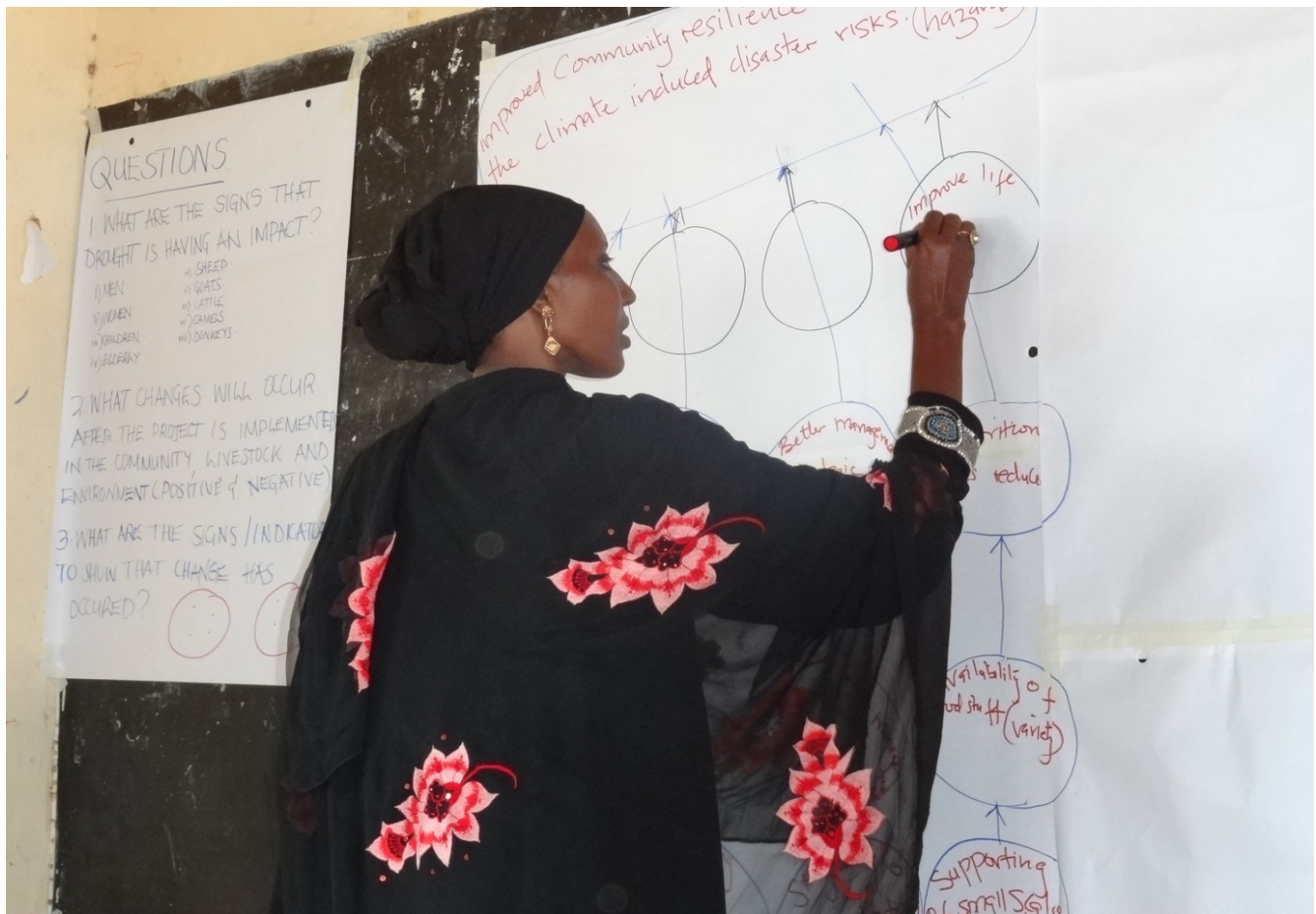
Merti Ward Committee member drawing the Merti's theory of change