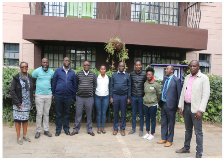
Participants posing for a photo during the drafting of the KSG manual

CCCF training manual developed in collaboration with Kenya School of Government. This will go a long way in ensuring that training and support is provided to both government officials and non-state actors interested in the CCCF mechanism on a sustainable basis.