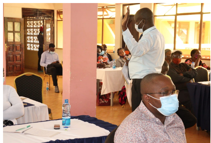
The CCCF contextualisation workshop in LREB

Two LREB counties (Vihiga and Kisumu) under the scale-out contextualised CCCF. The counties are now ready to establish CCCF structures in urban and peri-urban environments to address climate change impacts.